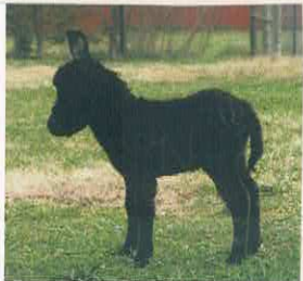
HHAA Unique Monique 2