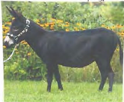
Merry-Go-Round's Iridessa 2.jpg

The American Donkey & Mule Soc PO Box 1210 Lewisville TX 75067 (972) 219-0781 Www.lovelongears.com