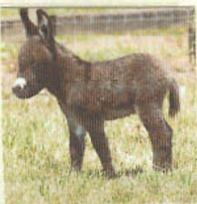
HHA Whimsy 2.jpg

The American Donkey and Mule Society P.O. Box 1210, Lewisville, TX 75067 (972) 219-0781 The American Donkey and Mule Society is not responsible for errors in information submitted to the registry.