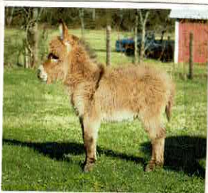
HAA Rojo's Red Raider 2.j

The American Donkey and Mule Society, PO Box 1210, Lewisville TX 75067 www.lovelongears.com/ (972) 219-0781 The American Donkey and Mule Society is not responsible for errors in information submitted to the registry.