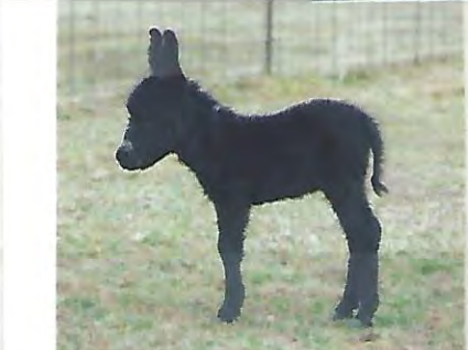
HHA Punch Drunk (Topsy) 2

The American Donkey and Mule Society P.O. Box 1210, Lewisville, TX 75067 (972) 219-0781 The American Donkey and Mule Society is not responsible for errors in information submitted to the registry.