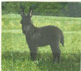
HHA Bruise Control 2.jpg

The American Donkey and Mule Society, PO Box 1210, Lewisville TX 75067 www.lovelongears.com/ (972) 219-0781 The American Donkey and Mule Society is not responsible for errors in information submitted to the registry.