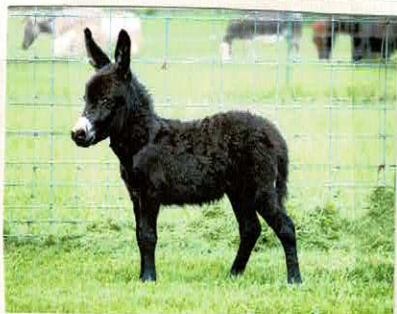
HHAA It's My Party 2.jpg

The American Donkey and Mule Society. PO Box 1210, Lewisville TX 75067 www.lovelongears.com/ (972) 219-0781 The American Donkey and Mule Society is not responsible for errors in information submitted to the registry.