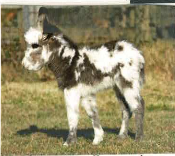
HHAAs Excellente 4.jpg

The American Donkey and Mule Society, PO Box 1210, Lewisville TX 75067 www.lovelongears.com/ (972) 219-0781 The American Donkey and Mule Society is not responsible for errors in information submitted to the registry.