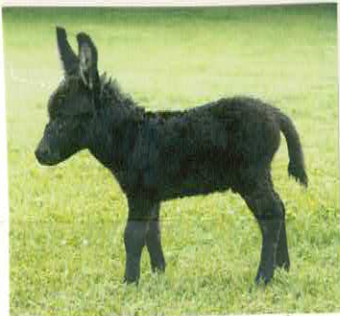
HHAA Dark Matter 2.jpg

The American Donkey and Mule Society, PO Box 1210, Lewisville TX 75067 www.lovelongears.com/ (972) 219-0781 The American Donkey and Mule Society is not responsible for errors in information submitted to the registry.