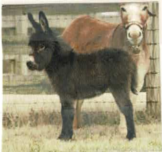
HHAA A Penny Saved 2.jpg

The American Donkey and Mule Society, PO Box 1210, Lewisville TX 75067 www.lovelongears.com/ (972) 219-0781 The American Donkey and Mule Society is not responsible for errors in information submitted to the registry.