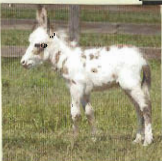
HHAA Taste the Rain 24

The American Donkey and Mule Society P.O. Box 1210, Lewisville, TX 75067 (972) 219-0781 The American Donkey and Mule Society is not responsible for errors in information submitted to the registry.