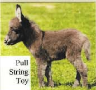
Pull String Toy