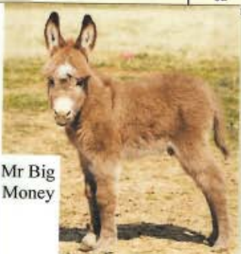
Mr Big Money